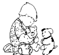
God Hears and Answers Prayers

Please note: If you have a prayer request and want it put in the bulletin, please write it down on the Friendship Pad or notify the office before noon on Wednesday. Prayer requests will remain for 4 weeks unless otherwise requested. Please continue to pray for those who have been removed.