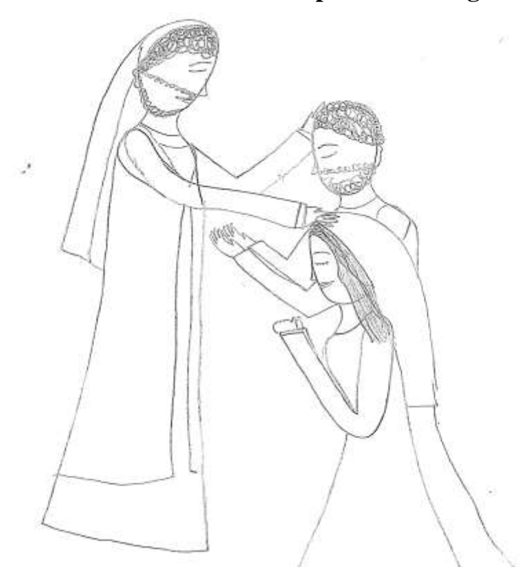
Welcome to worship at Good Shepherd Lutheran Church.

We would like everyone to fill out the Friendship Pad at the end of the pews and pass it along for all to fill out. Please also mark the names of all in the family who are receiving Communion. If you are visiting, please include your address and phone number .We are delighted to have you.