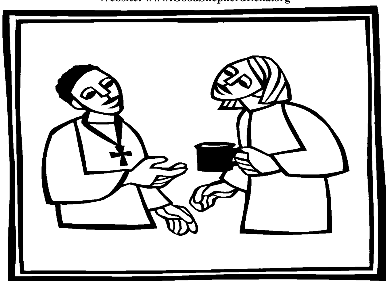
Welcome to worship at Good Shepherd Lutheran Church.

We would like everyone to fill out the Friendship Pad at the end of the pews and pass it along for all to fill out. Please also mark the names of all in the family who are receiving Communion. If you are visiting, please include your address and phone number. We are delighted to have you.