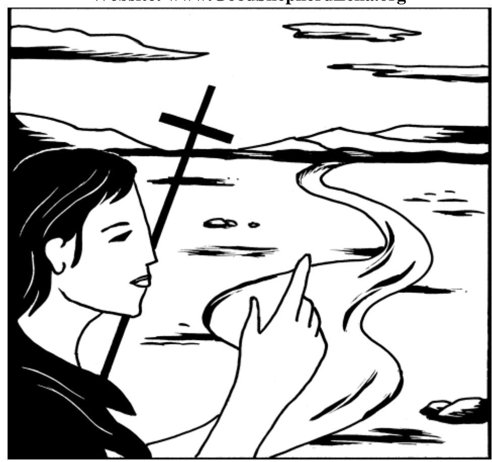
Welcome to worship at Good Shepherd Lutheran Church.

We would like everyone to fill out the Friendship Pad at the end of the pews and pass it along for all to fill out. Please also mark the names of all in the family who are receiving Communion. If you are visiting, please include your address and phone number. We are delighted to have you.