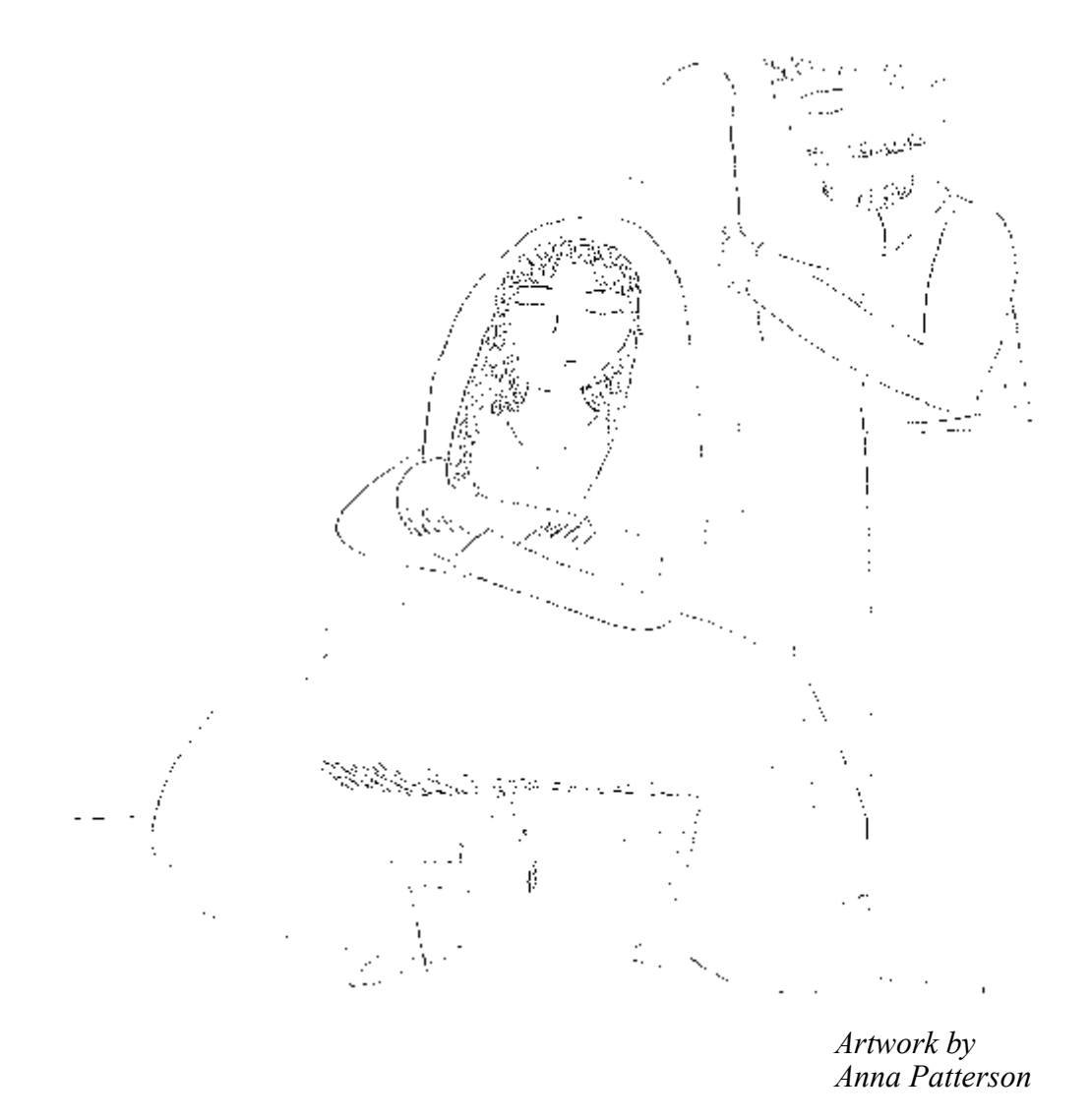
The Good Shepherd cares for us. He gives His Life for us and to us. We give and use our lives in love, care and service of one another.