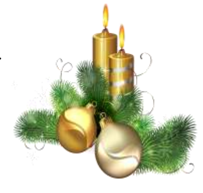
Christmas Day Worship Service Carols through the ages December 25th at 9:30am.

Worship service filled with music and light. December 24<sup>th</sup> at 7:30pm