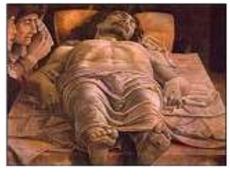
12<sup>th</sup> egg will be given on resurrection of Jesus.