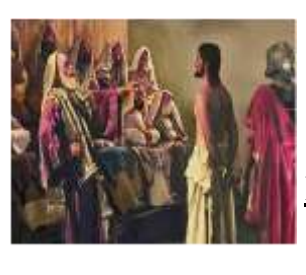
Pilate and Herod. Luke 23:1-