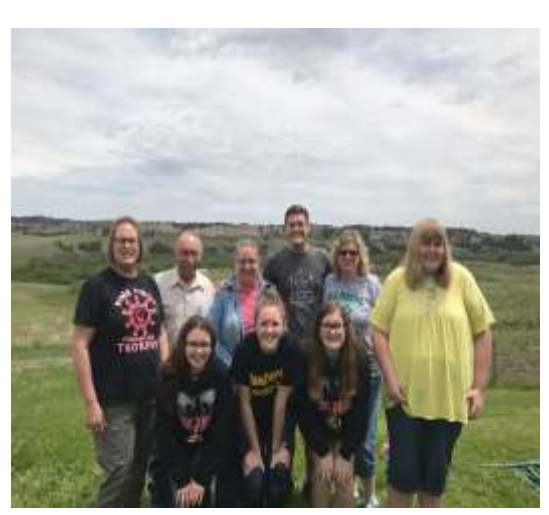
Thank You For Your prayers and Support