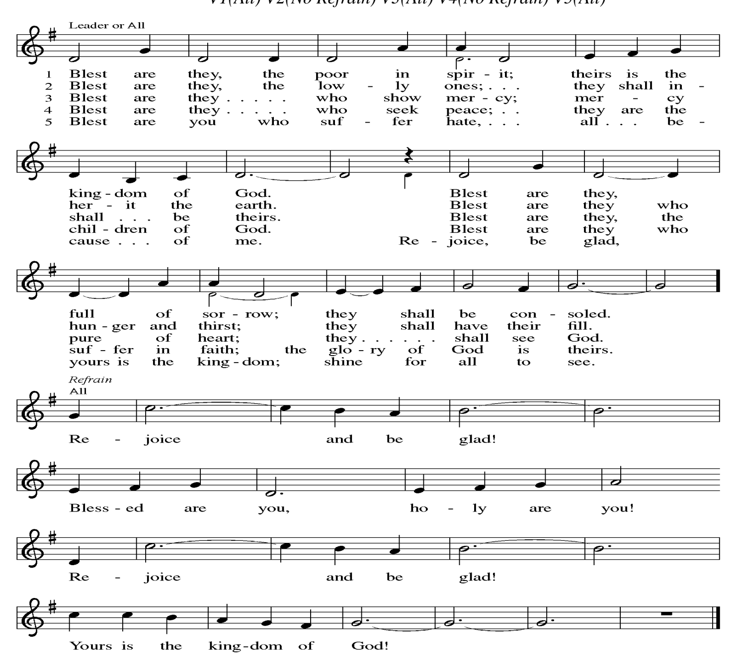
Blessed Are They V1(All) V2(No Refrain) V3(All) V4(No Refrain) V5(All)