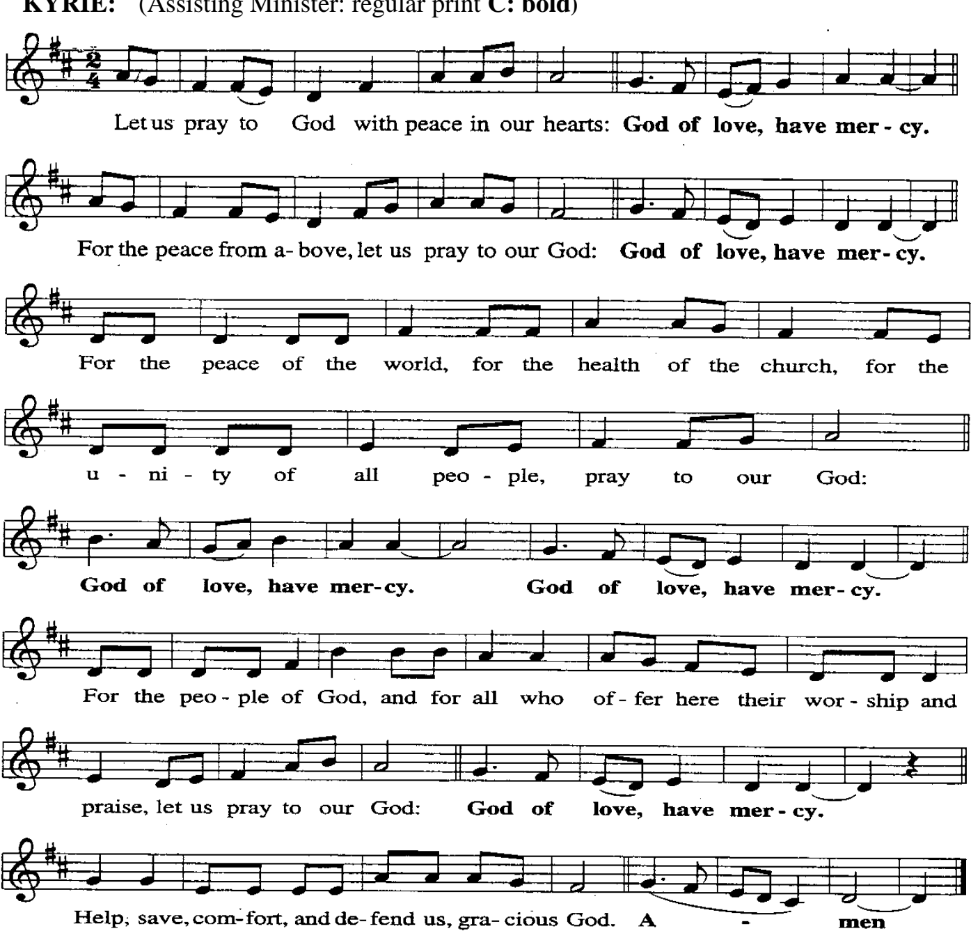
KYRIE: (Assisting Minister: regular print C: bold )