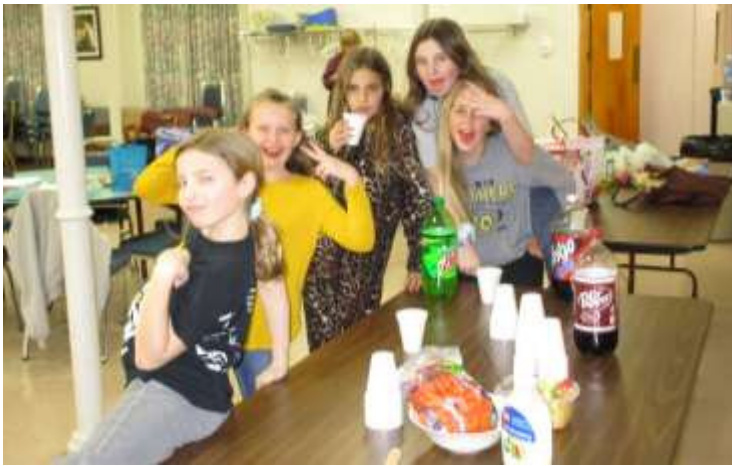
Youth OWL Night